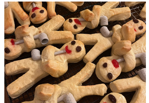
Weckmänner, a traditional treat for St. Martin's Day