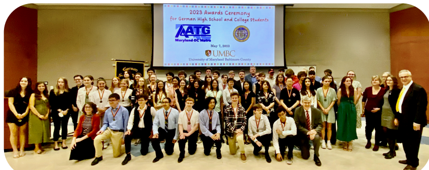
The Society honored 48 high school students for their outstanding performance on the 2023 National German Exam. See page 2 for the full story.