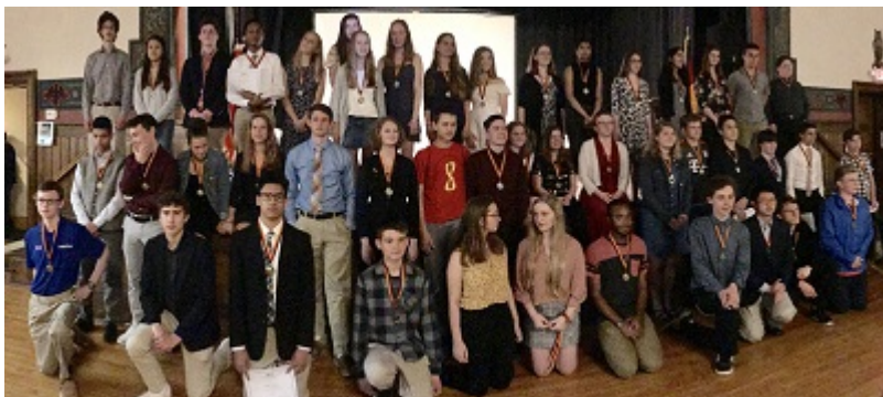
Student Award Winners