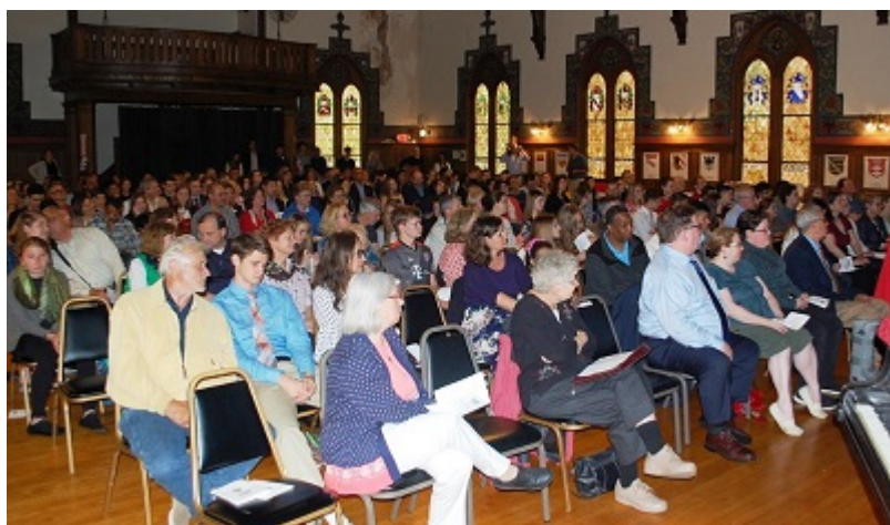
Student, parents, teachers and guests in the Adlersaal