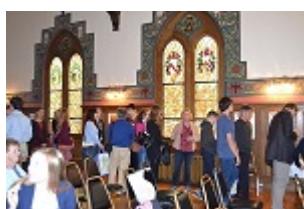
Refreshments are served after the ceremony