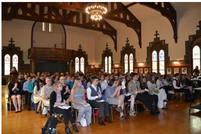
The audience in the beautiful Adlersaal at Zion Church